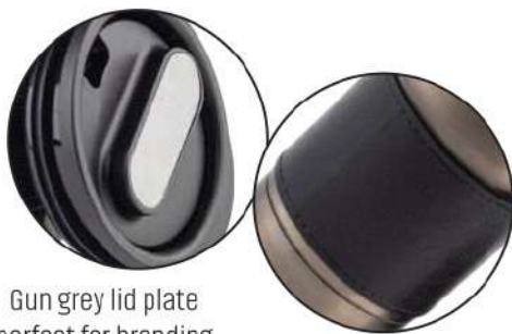
Gun grey lid plate perfect for branding

Stay stylishly refreshed with this 530ml double-wall vacuum stainless steel tumbler, featuring a PU sleeve, gun grey accents, and a secure black lid. Its double-wall insulation keeps beverages hot or cold for hours without condensation. Durable, sleek, and comfortable to hold, it's the perfect companion for work, travel, or daily use