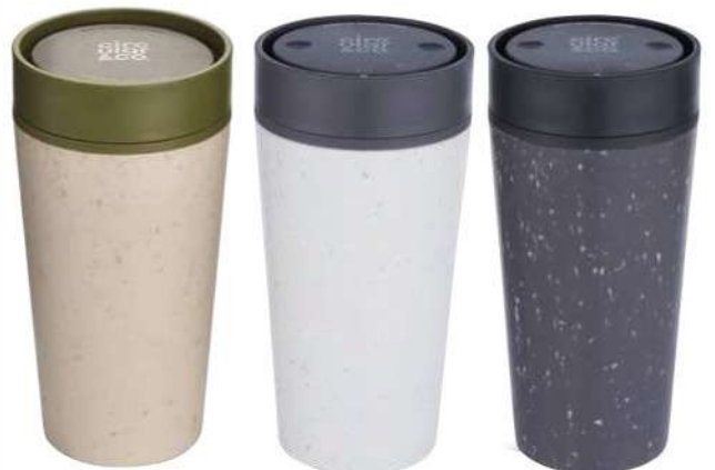
Cream & Honest Green

Packing Details : 58.2 x 38.5 x 38.9 cm; 48 pc/carton; gw/nw: 12.8/10.1kg/carton