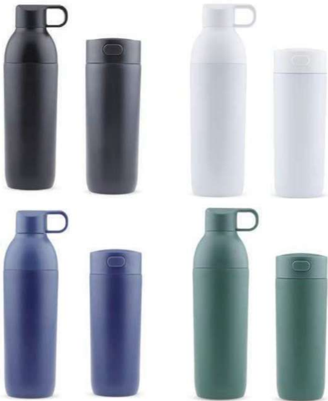
Coffee Mug Lid