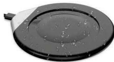
Wireless / Heating Coaster is waterproof