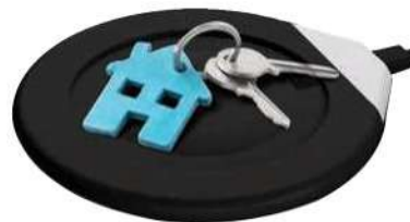
Intelligent Foreign object Recognition identifies metal items that are accidentally place in panel

Packing Details : 59 X 41 X 35 cm; 24 pcs/carton; gw/nw: 19.5/18.5 kgs /carton