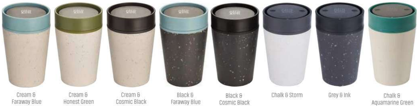
Cream & Faraway Blue