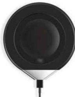
Smart Safety Feature - Foreign Object Detection Wireless charger and heating coil remain shut when a foreign object is detected