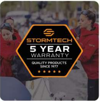
GUARANTEED 5-YEAR WARRANTY