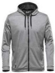
Men's Halifax Hoody

Imported from overseas. Delivered within 2-3 weeks. Inquire for stocks & prices.