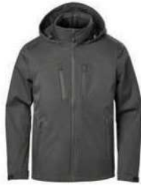
Men's Scirocco Lightweight Shell