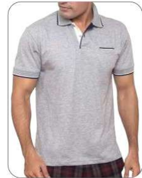
Grey - Navy / White