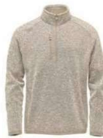
Men's Avalante 1/4 Zip Pullover