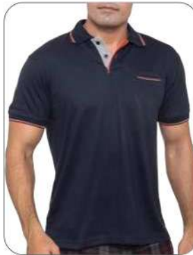
Navy - Red / Grey