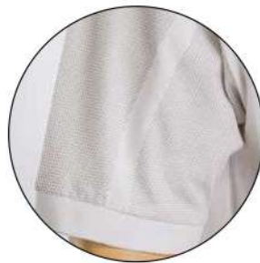
Berries on sleeve