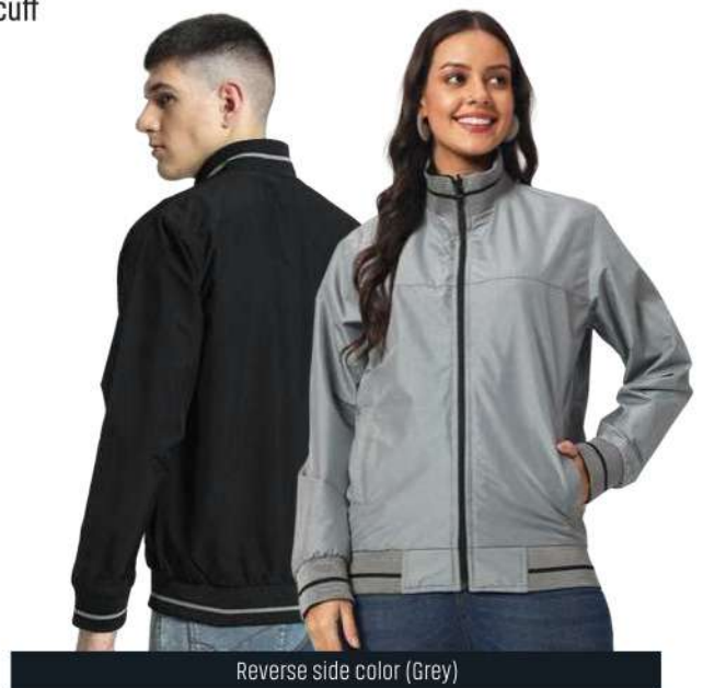
Reverse side color (Grey)

Packing Details : 63.0 x 44.0 x 33.0 cm; 25 pcs / carton; gw/nw: 12kg/ carton