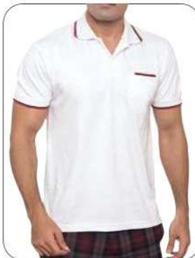
White - Red / Navy