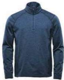
Men's Treeline Performance 1/4 Zip Pullover