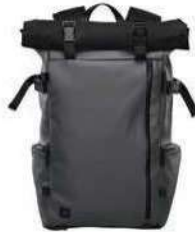
Norseman Roll Top Pack