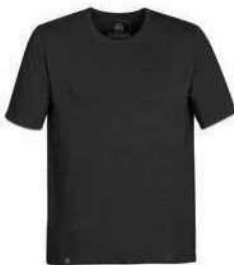
Men's Baseline Short Sleeve Tee