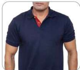
Gulf blue (Navy blue/Red)