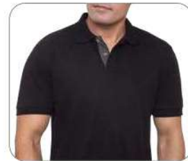
Lava (Black/Dark melange)