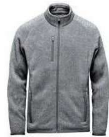
Men's Avalante Full Zip Fleece Jacket