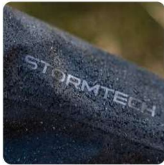
PRODUCT QUALITY ASSURANCE