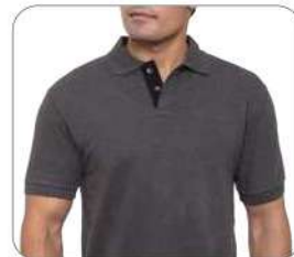
Ebonite (Dark melange/Black)