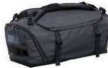
Equinox 30 Duffel Bag