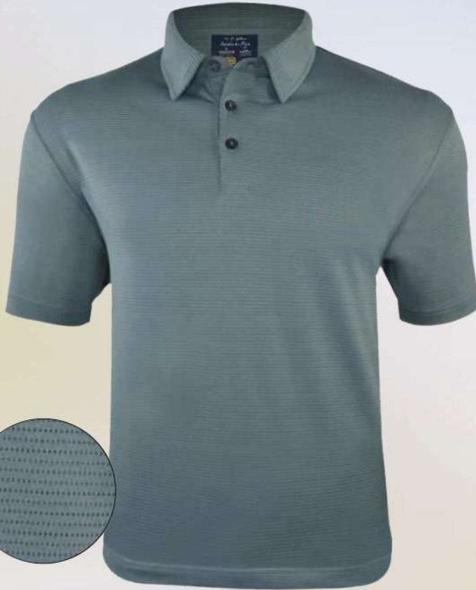
Special textured 2-tone knit fabric