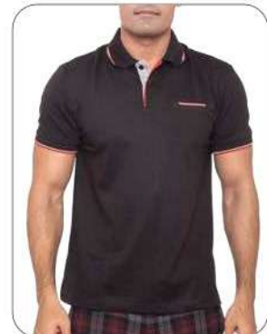
Black - Red / Grey