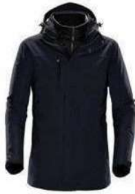
Men's Avalante System Jacket