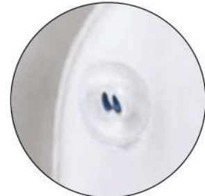
Frosted top button with contrast color stitch