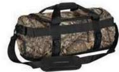
Atlantis Waterproof Gear Bag (Small)