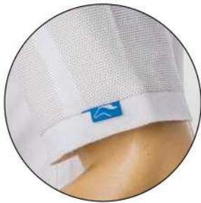
Trendy silicon brand tag