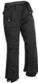
Ascent Hard Shell Pant