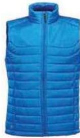
Men's Nautilus Quilted Vest