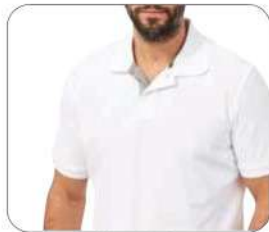
White cloud (White / Light melange)