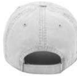
Cloth Strap with Velcro