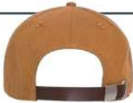
Leather Strap with Buckle