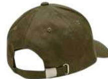
Cloth Strap with Buckle