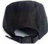
Polyester Strap with Clip