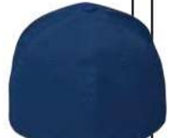
Elastic or Fitted